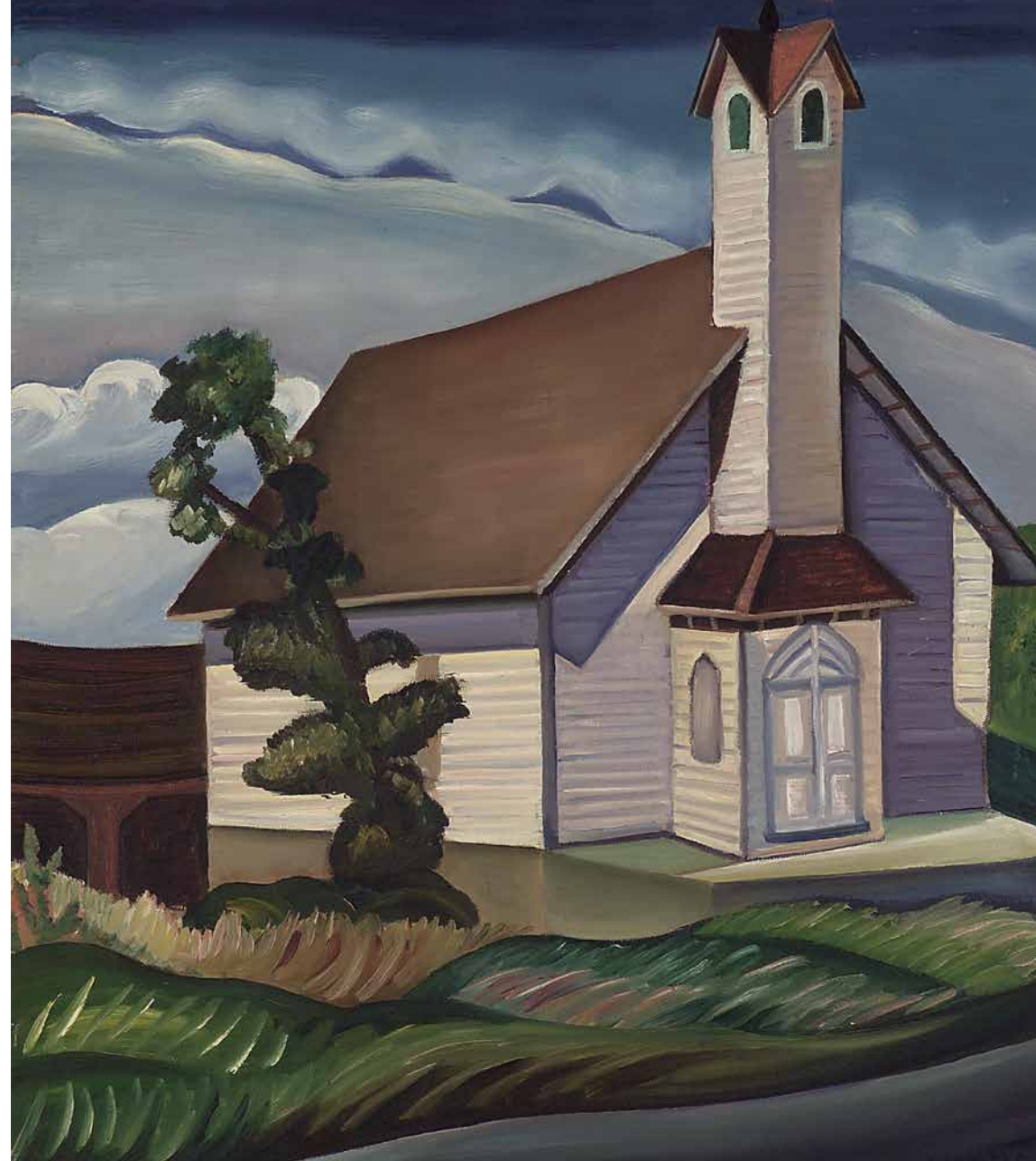
OLD CHURCH, Prudence Heward, 1932