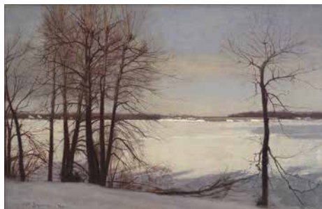
WINTER, William Brymner, 1891

The museum hosts temporary exhibitions of visual arts featuring artists from the region and elsewhere, and is also developing a showcase for contemporary textile arts.