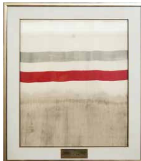
FIRST YARD OF SILK WOVEN IN CANADA, Bruck Silk Mills, 1922

The Bruck Museum intends to reveal the history of Cowansville's workers and preserve the intangible heritage of the Bruck Mills and the textile industry of the Eastern Townships. In view of the centennial of the factory, the Museum proposes to link this industrial heritage with contemporary textile arts and to promote this legacy with exhibitions, documentaries and programs which engage both francophone and anglophone communities in the region.