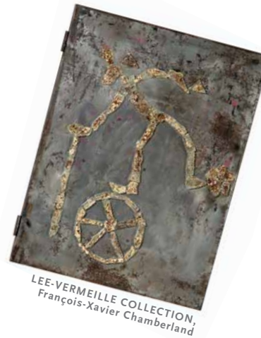
LEE-VERMEILLE COLLECTION, François-Xavier Chamberland