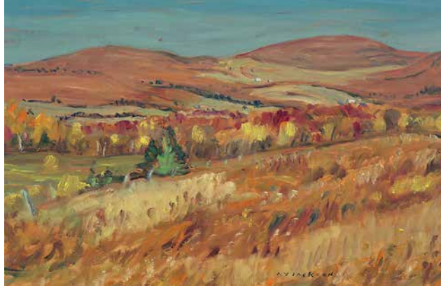
HILLS OF BOLTON GLEN, PQ, A. Y. Jackson